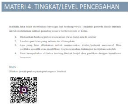
Fig. 3. Videos and Interactive quiz at each end of the material started when the QR code is touched

One of the types of viruses discussed in this E-book is HIV (Human Immunodeficiency Viruses) that causes AIDS (Acquired Immune Deficiency Syndrome), which is a collection of symptoms of damage to the immune system. This topic is related to puberty that occurs much in the younger (premature) age in various parts of the world, including Indonesia. However, pubertal education has not been the norm, especially at elementary school level [7]. The intended education should be designed so that adolescent friendly [6,8] and sensitive culture [6,9] to complement the discussion in the class.