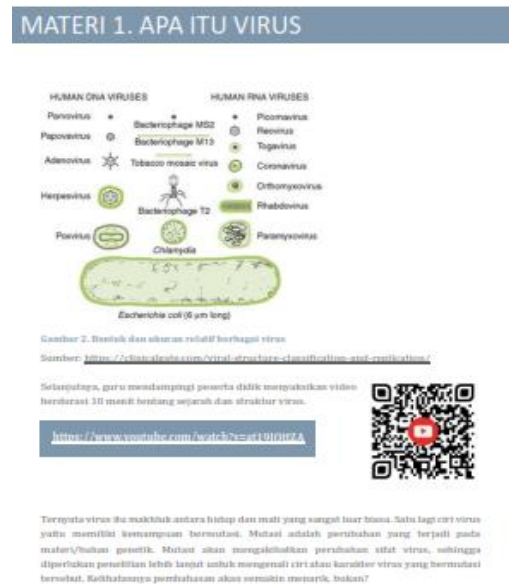
Fig. 2. Videos embedded using QR code.

Some notes primarily related to the material presented in the video. Although in general, respondents assessed that the whole material is very interesting and easy to understand, but some consider the language to be less suitable for high level elementary students. Keep in mind that this book is the teacher's grip, so the target audience is not for learners directly. This book is expected to increase the capacity of teachers in delivering material about virus.